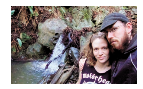
NEWS A pregnant lady gets lost in the Big Sur wilderness. 6