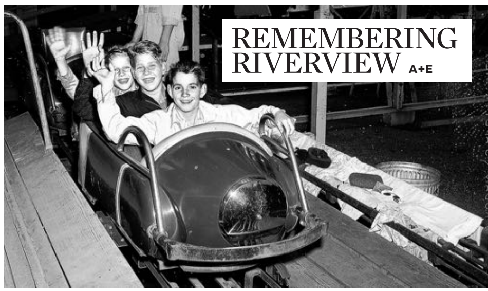
CHICAGO TRIBUNE 1962

SUNDAY SAVINGS: MORE THAN $230 IN COUPONS INSIDE