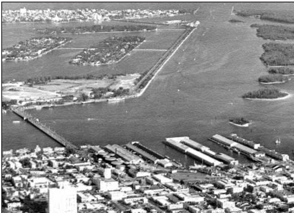
Florida's Biscayne Bay in monumental collision with nature

At El Nuevo , those few editors who are beginning to understand the importance of covering science and the environment have at least declared a willingness to help place my freelance work. It is not easy to open a path in a stubborn jungle. It is going to happen, however, not just in Florida but also in New York, Texas, and California, because we can't afford not to let it happen. SEJ is a powerful tool in this effort. It makes my job less solitary.