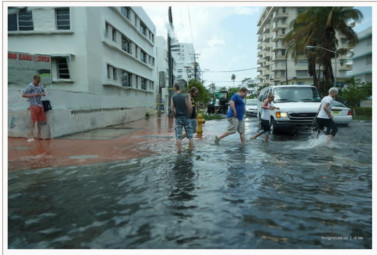
Flooding in Miami Beach. Low-lying Florida is the state most susceptible to the effects of climate change.