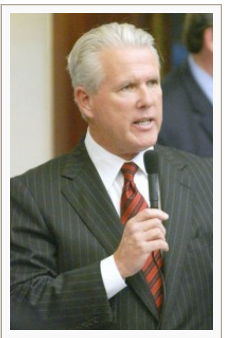
State Rep. Stan Mayfield, R-Vero Beach, sponsored Florida's legislation to address the effects of climate change.

Not only was the Scott administration and the Republican-controlled legislature not interested in dealing with climate change, but they worked to roll back the laws passed during Crist's term in office.