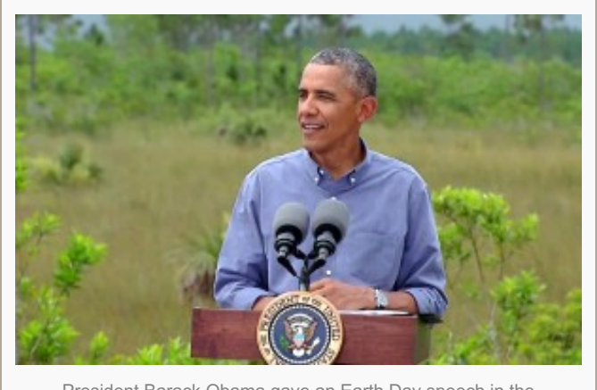
President Barack Obama gave an Earth Day speech in the Everglades, saying climate change "can't be edited out."

Members of the compact are monitoring a host of complex threats they anticipate. Increased flooding could put humans into contact with bacteria, for instance. A warmer climate may become more hospitable to diseases.